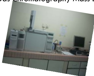
Gas Chromatography Thermal Conductivity Detector (GC-TCD)